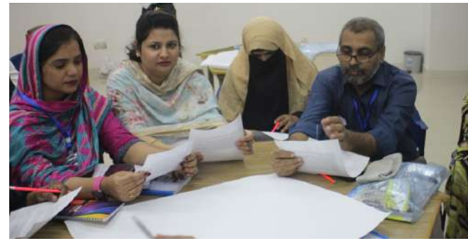
SIPD Staff with Leadership Training Batch One

In the second quarter of 2025, SIPD successfully conducted two batches of the Residential Leadership and Education Management Training Program. The first, from May 19-31, 2025, trained 35 headteachers (19 female, 16 male), and the second, from June 16-28, trained 38 (19 female, 19 male). The curriculum blends theory with practical activities, including case studies, group work, a gallery walk, and the use of the computer lab.