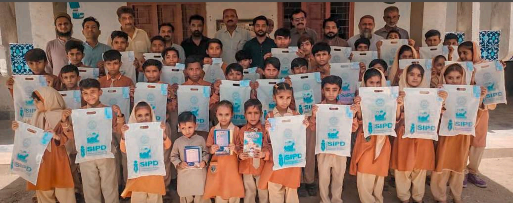
Prize Distribution Ceremony at the Government Boys Primary School, Main Sindhi Tando Allahyar