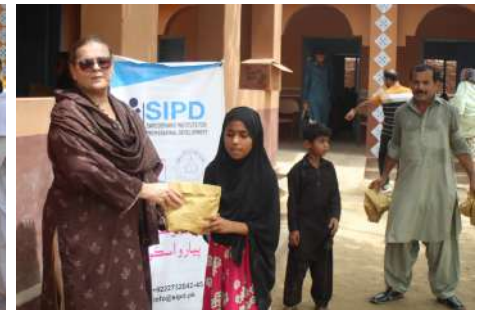
Sweets were shared among the students