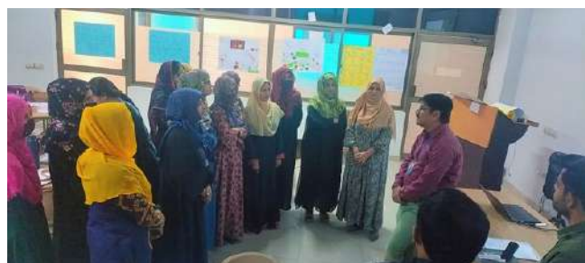
Moments from the 'My School Program' activities during our ECCE training