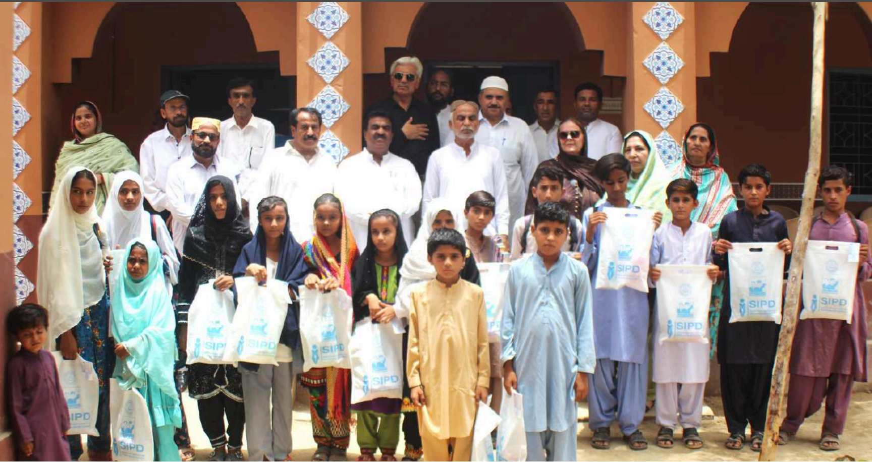
Celebrating Progress: Infrastructure Milestone at GBPS Shah Baig Lund