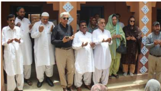
The Dua moment was captured