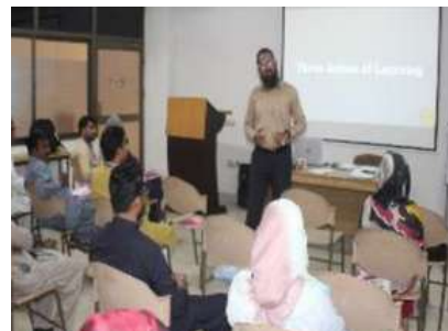
Moments from 'My School Program' Activities During the Mathematics Training Program