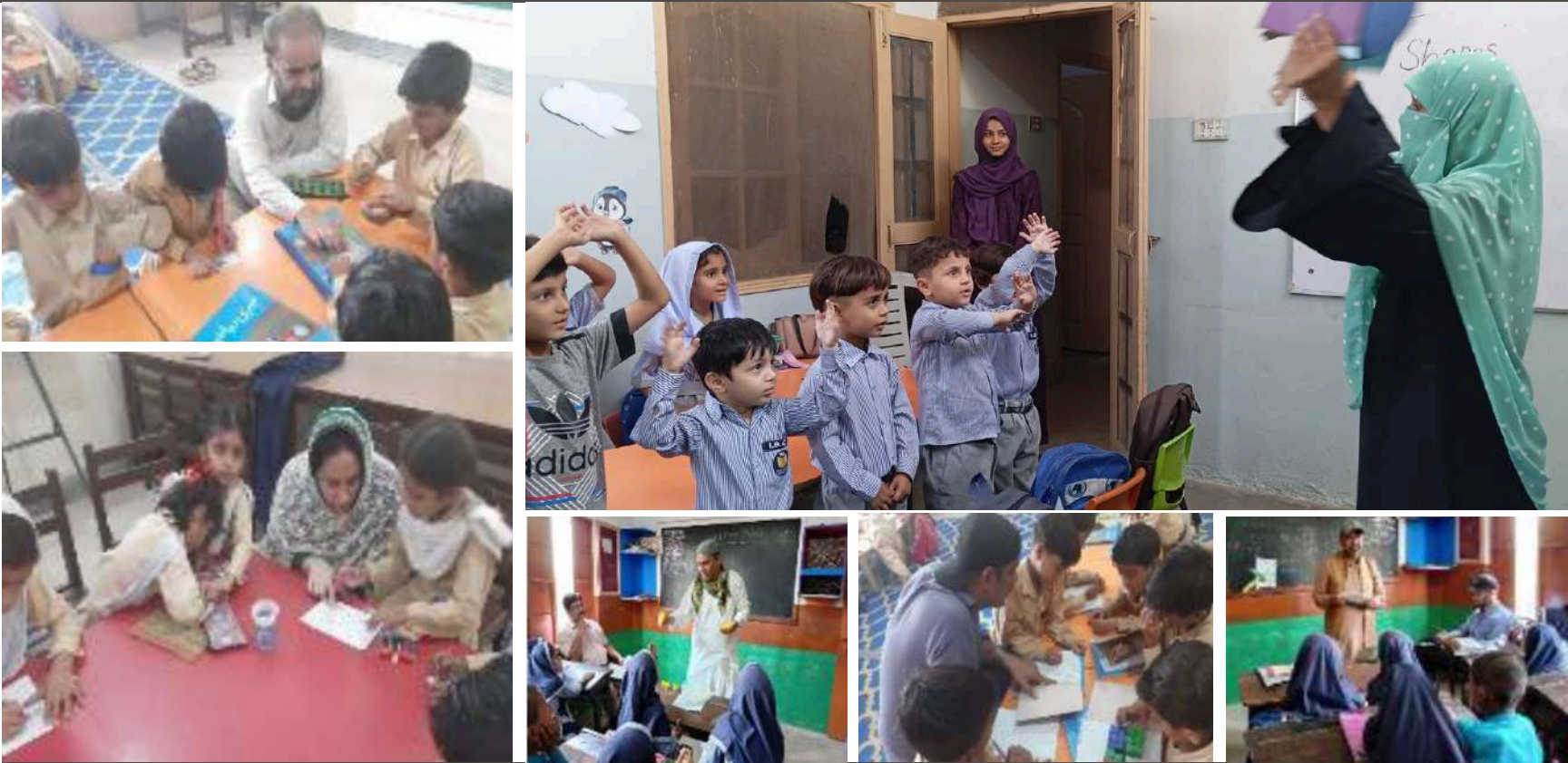
Diploma participants visited The Citizen Foundation, IBC School, and The Educate Sindh School in Tando Allahyar's district, as part of their program classes