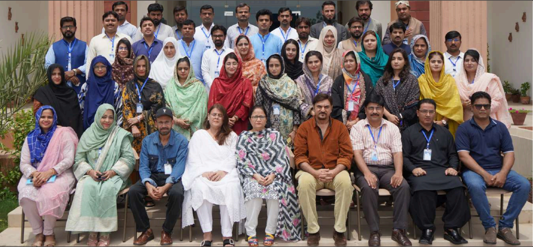
SIPD Staff with Leadership Training Batch Two

SARGODHIANS' INSTITUTE FOR PROFESSIONAL DEVELOPMENT