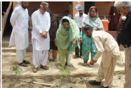
Moments were captured during tree plantation